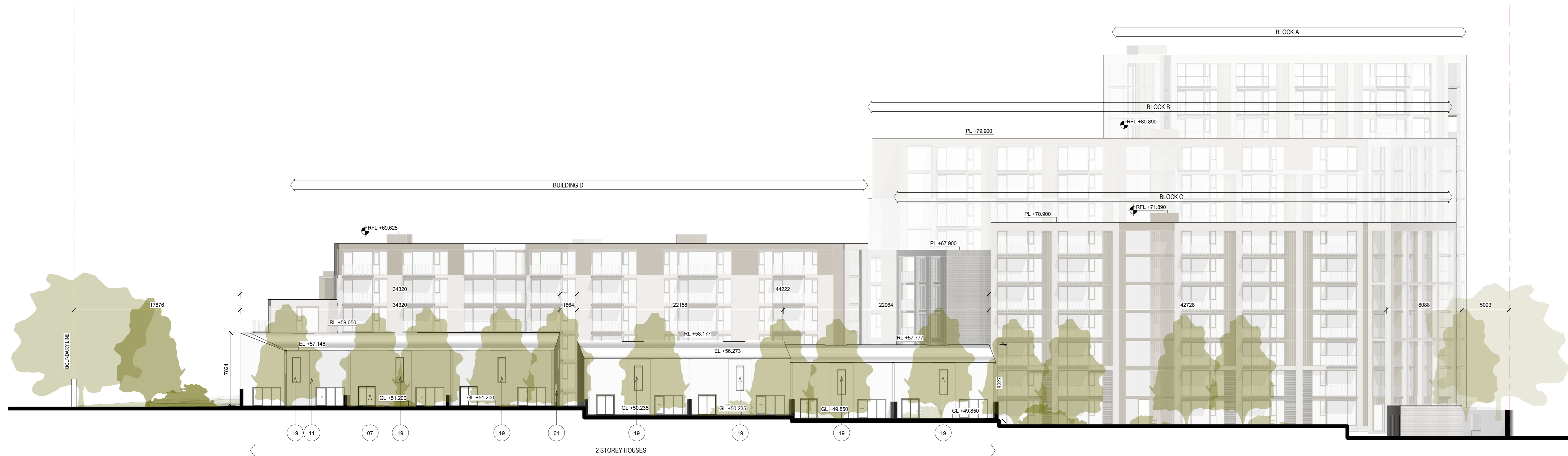
1 OVERALL ELEVATION - HOUSES EAST 1 : 200