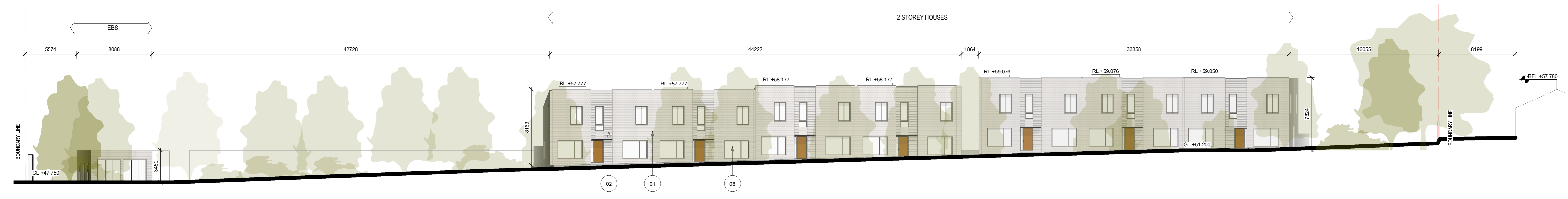
2 OVERALL ELEVATION - HOUSES WEST 1 : 200